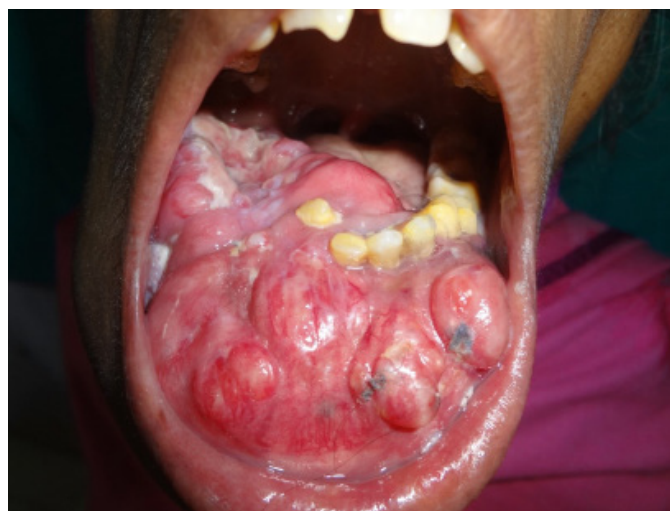
Figure 1: Picture showing intraoral view of osteosarcoma

The patient was thin built, sitting comfortably in bed and was well oriented to time, place and person. Her all vital parameters were in normal range. On clinical examination, The swelling was located on mandible measuring 6x4 cm in size with multiple nodules extending from left 2nd premolar to right side retromolar region, skin overlying the swelling was erythematous (Figure 1). There was no tenderness with normal temperature and texture. The lesion was firm to hard in consistency with irregular margin and multiple breaches in mucosa with obliteration of labial and lingual vestibule. Tongue movements were normal with paraesthesia of lip on the right side was noted. There was no cervical lymphadenopathy with adequate mouth opening and TMJ movements were palpable.