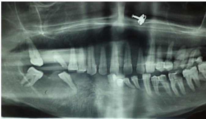
Figure 2: showing sunburst appearance of the right jaw adjacent to the first premolar

of left 2nd premolar and was edentulous with only 2nd premolar and first molar on right side (Figure 2). Bone scan shows abnormally increased uptake of radionuclide in lower jaw region and focal area of abnormal increased uptake of radionuclide in right femur (Figure 3).