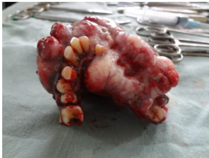
Figure 4: Tumour after resection

grade), intra compartmental anatomic location of the tumour was diagnosed and treatment plan was established.